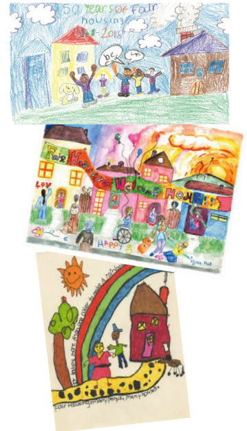
Past contest winners

Whether you choose to incorporate the poster contest as an in-class activity, or simply provide students with the opportunity to participate outside of class, we hope you will join with us to promote awareness of fair housing rights!