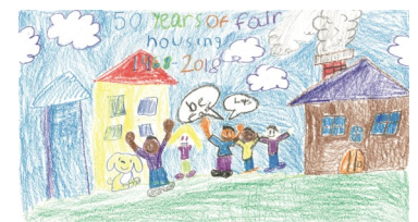
Past contest winners

2023 CONTEST DATES: Monday, January 9 through Friday, February 24